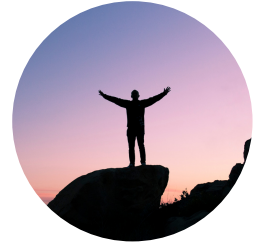
3. Purpose & Meaning