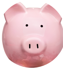
8. Financial Security