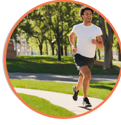
2. Physical Activity