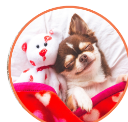
12. Adequate Sleep