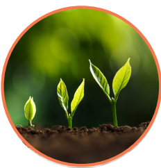
10. Personal Growth