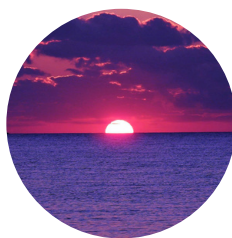
11. Nature & Environment