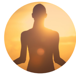
6. Meditation & Mindset